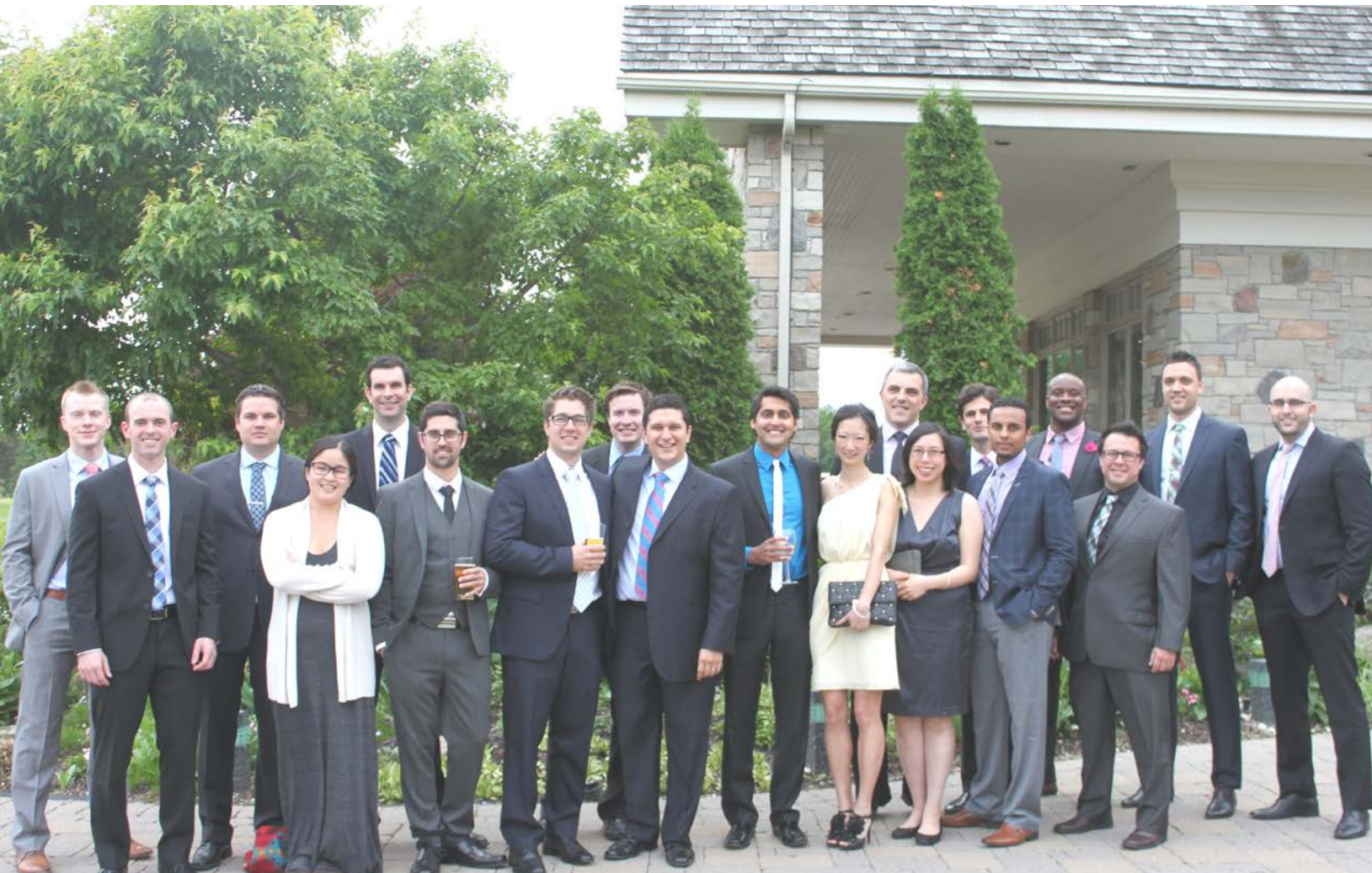
PICTURED BELOW: DEPARTMENT OF SURGERY GRADUATING RESIDENTS