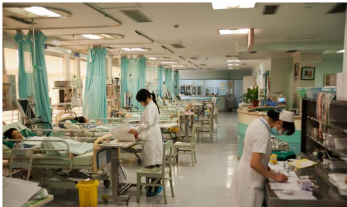
Cardiac Surgery Recovery Room, West China Hospital