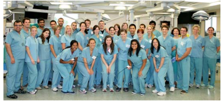
Participants of the 2011 CSTAR Interprofessional Surgery and Anesthesia School

Founded in 2009 by Schulich MD Class of 2012 student,