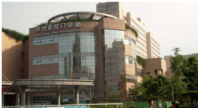
West China Hospital, Sichuan University