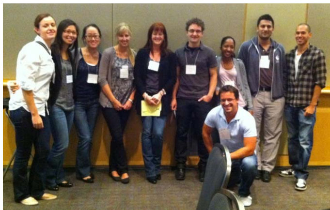
Second year Schulich students who attended