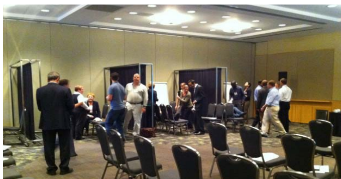
Trauma bays during a massal

Faculty are writing up the exercise as a template to hold further courses with the Canadian Surgery Forum as it travels annually around Canada. Next year it will be held in Calgary, Alberta. The participants of the inaugural exercise felt it was a good model to involve all the medical professions, as well as trainees, in hospital preparedness. The manual will be available for free to others who wish to hold similar training exercises.