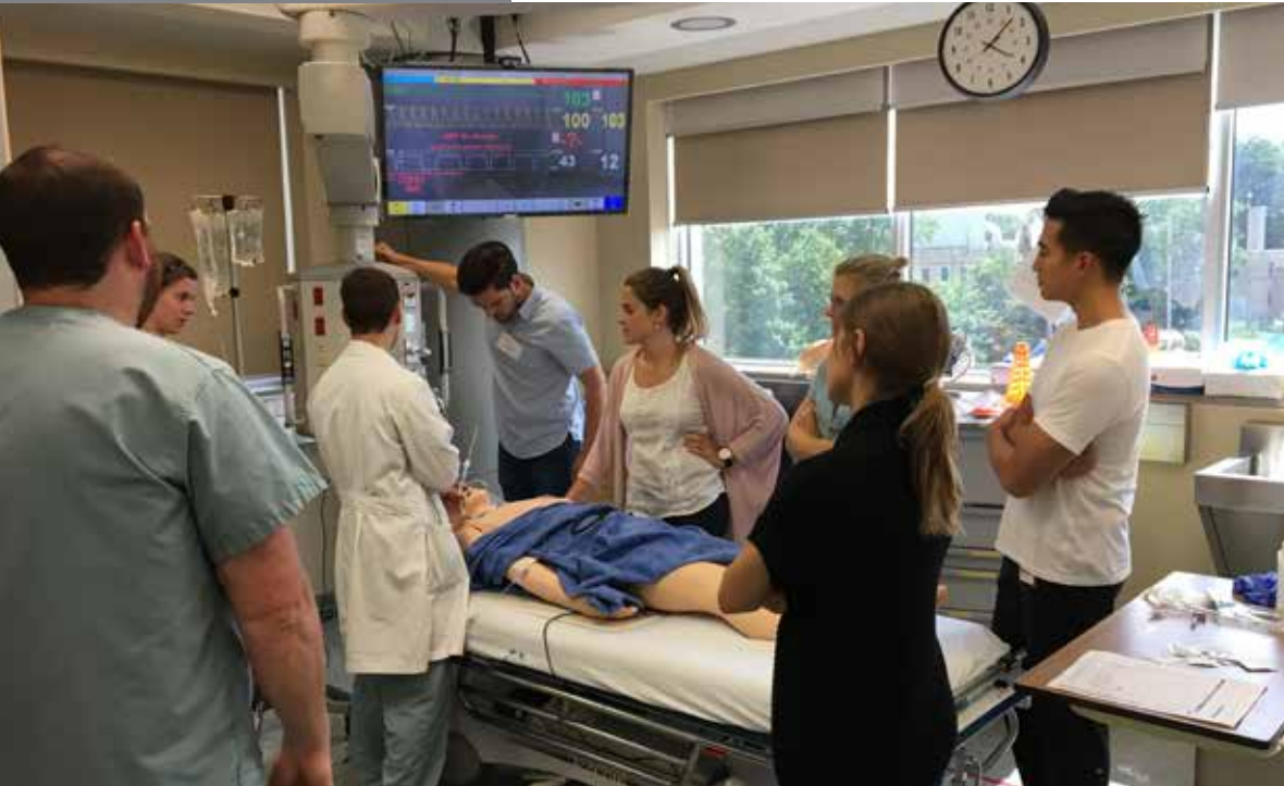
PICTURED LEFT AND BELOW: 2017-2018 PGY 1 SURGERY RESIDENTS PARTICIPATE IN THIS YEAR'S PGY 1 SURGERY RESIDENT BOOT CAMP AT LONDON HEALTH SCIENCES CENTRE'S CSTAR.