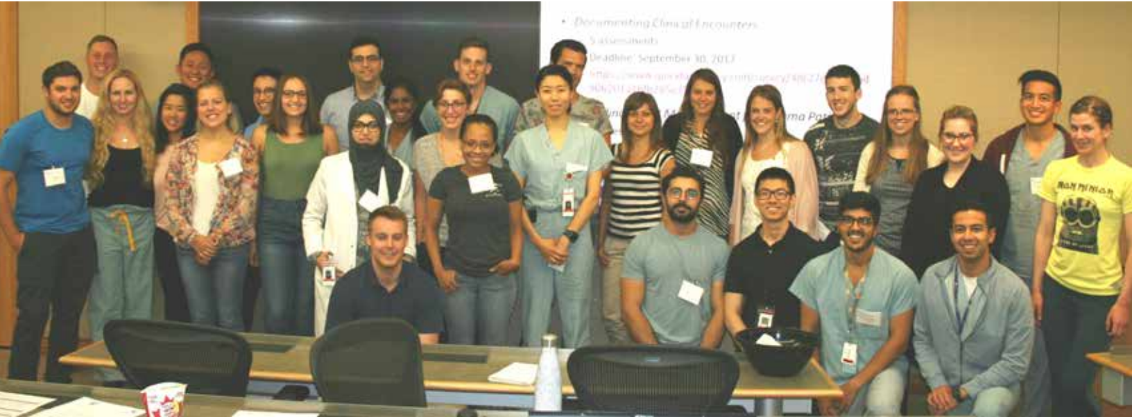
WELCOME TO OUR PGY 1 STUDENTS! SEE PAGE 6 FOR DETAILS.