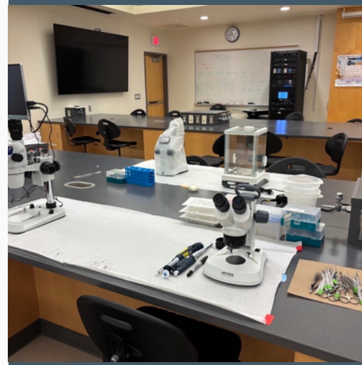
The Department of Physiology and Pharmacology cell culture teaching facility