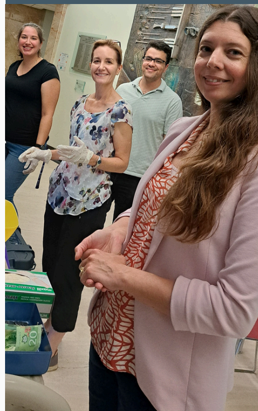
PHYSPHARM ICE CREAM SOCIAL 2024 RAISING $540.10 FOR THE FOOD BANK

Welcome to all the new graduate students joining the Physiology and Pharmacology Department! We are thrilled to have you as part of our academic community, where you will engage in cutting-edge research and collaborate with leading experts. We encourage you to get involved with the PhysPharm Graduate Student Council. We'll be having our first meeting in September, where elections will be held for council positions. We invite you to take full advantage of the resources and support available, and we look forward to your contributions. Welcome aboard, and here's to a great year ahead!