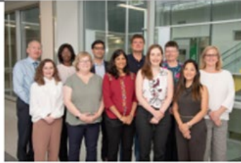
FACULTY MEMBERS DIVISION OF GERIATRIC MEDICINE