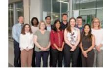
FACULTY MEMBERS DIVISION OF GERIATRIC MEDICINE