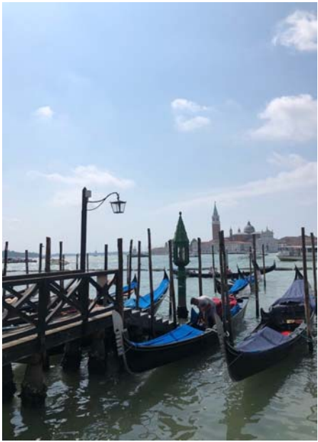
Weekend 1: Venice