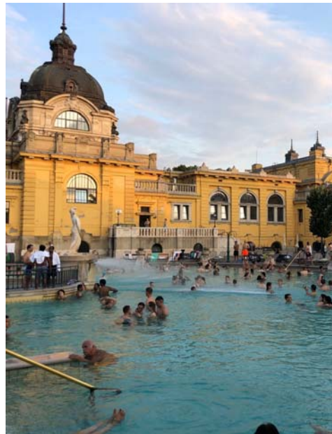
Weekend 2: Budapest