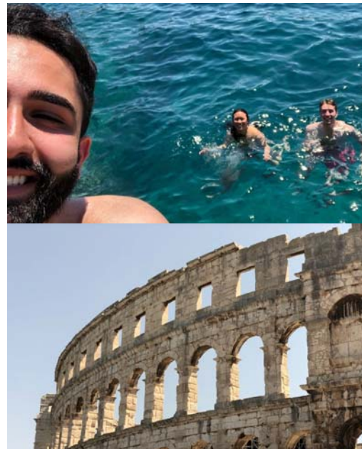
Weekend 3: Pula (Croatia)