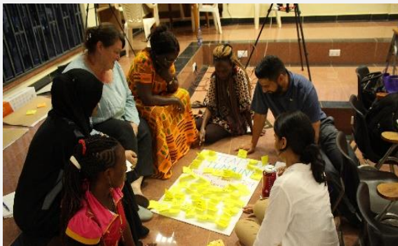
Fig 2. Fellows from the Global MINDS Fellowship Program 2017-18 cohort engaging in sense-making techniques with Western University faculty and community partner representative (Africa Mental Health Research and Training Foundation) in Machakos, Kenya.