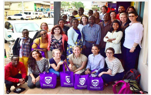
Global MINDS Fellowship Program Page 4

Global MINDS is an Interdisciplinary Development Initiative of Western University: