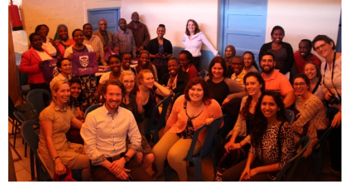
Pictures (L-R): (1) Mindfulness Ambassador Council, (2) Team Tumaini working on actors for their system map, (3) Point Tech employees and their family members presented their experience and personal and professional growth due to CREATE Kenya to GMFP students and faculty/staff.