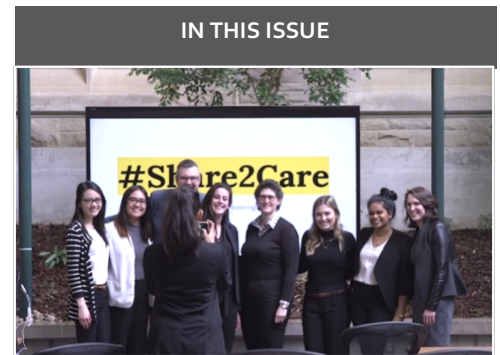
Graduate Course Page 3