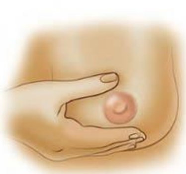
press (back towards your chest)