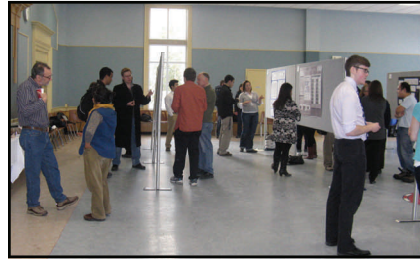
Poster Session (Kingsmill Room)

The Showcase featured posters of research highlights from Biochem-