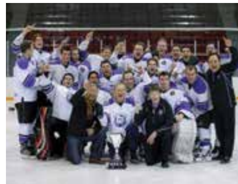
Schulich Dentistry's hockey team celebrates a victory at the ODA President's Cup Classic in Toronto.